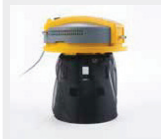
Nylon protection filter