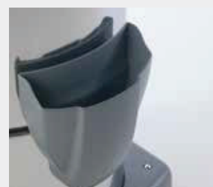
Large and robust filling port