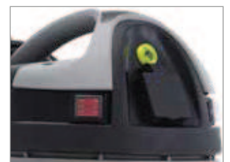
ADDITIONAL SOCKET FOR POWER TOOL (TC) WITH AUTOMATIC START/STOP