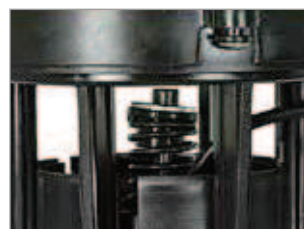
ELECTRICAL FILTER SHAKER